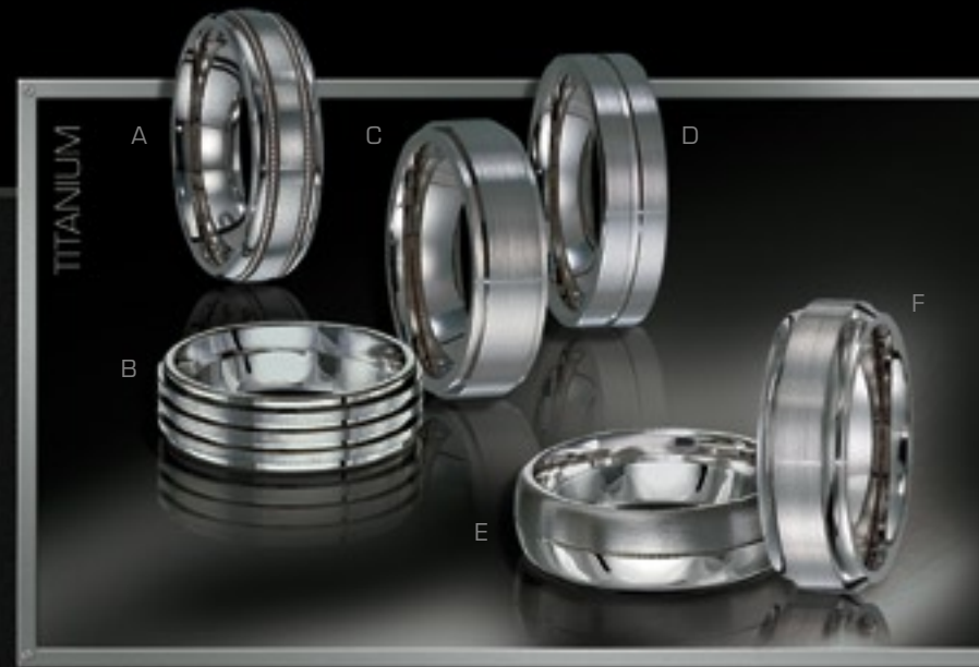
A. TI-3026 $109 B. TI-4121 $109 C. TI-0611 $109 D. TI-3022 $109 E. TI-0077 $109 F. TI-0013 $109

Zero to sexy in four performance metals.