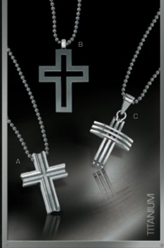
A. TI-0576 $139 B. TI-4696 $139 C. TI-5046 $139

The beauty of these exotic metals is in their exquisite craftsmanship, their fashion forward look, and their striking affordability. Wear them often, and enjoy the versatility and feel of these fantastic metals.