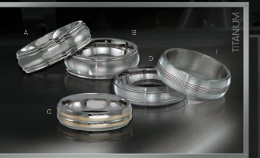
A. TI-0286 $109 B. TI-0139 $109 C. TI-0009 $109 D. TI-0432 $109 E. TI-4297 $109