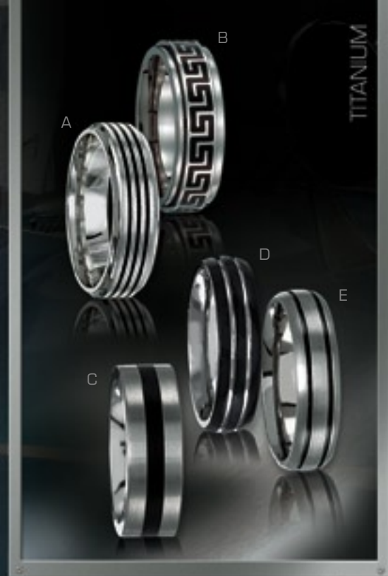
A. TI-5508 $119 B. TI-0215 $119 C. TI-5845 $139 D. TI-0316 $139 E. TI-3124 $119