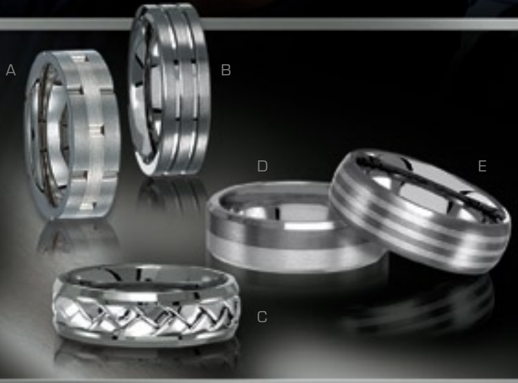
A. TI-4638 $139 B. TI-4455 $139 C. TI-4483 $239 D. TI-0103 $139 E. TI-4169 $139