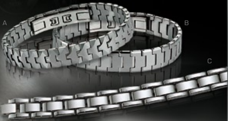
A. TTB0001 $169 B. TTB0004 $169 C. TTB0015 $179